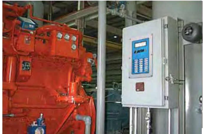
Exacta 21 on a reciprocating compressor

MIDAS (Monitored Information Devices And Systems) is a user-configurable graphical touch screen and data hub that delivers centralized access to critical information in parallel with the Exacta 21, which is mounted completely inside the panel. Unlike traditional PLC-based systems in which the only means of displaying system data is through the touch screen, the MIDAS offers an advanced, user-configurable, graphical data presentation capability, while preserving the high level of reliability and in-depth system configuration and access made possible by the Exacta 21. Essentially, the MIDAS incorporates the very best of both approaches by combining the advanced display capabilities of a PLC-based system with the reliability and serviceability of a control panel built around an independent, discrete device.