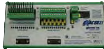
Exacta 21 Discrete Circuit Board

Modbus RTU can be connected to either communications port (RS232 or RS485). Selectable from 2400 to 19200 Baud, 8 Bit, No Parity (N 8 1).