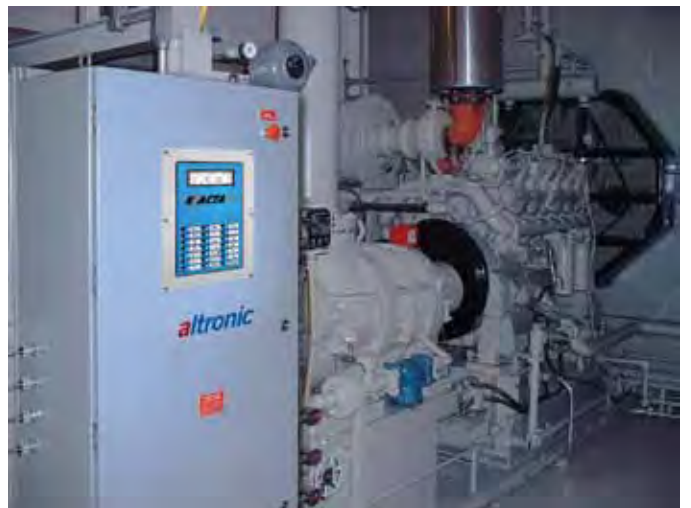
Exacta 21 on a screw compressor