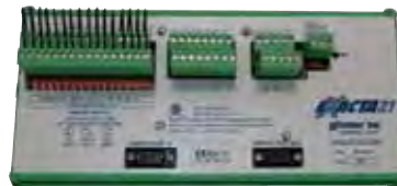
Exacta 21 Analog Circuit Board