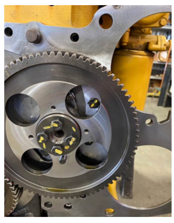
The trigger gear is shown removed. The three holes and one dowell are used to mount the disc. The dowell indexes the disc so that it cannot be incorrectly mounted. Original bolts re re-used.