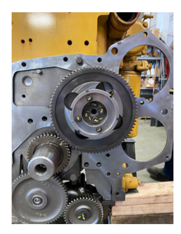
6+1 Disc mounted