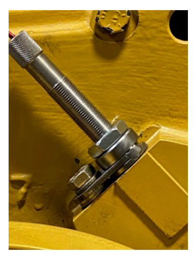
Pickup Bracket with PU mounted (shim washer for mounting bolt is provided). ½ turn of the pickup from touching the disc will yield the proper 0.020" gap.