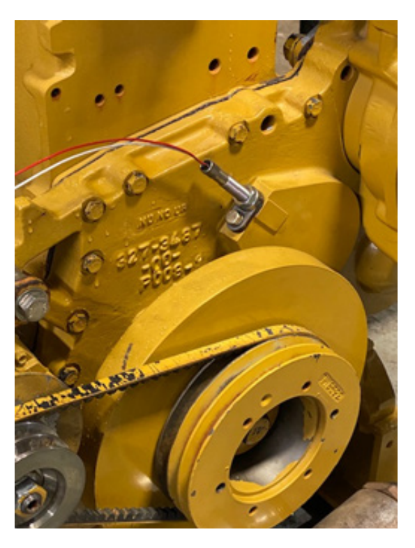
Engine Front cover re-assembled