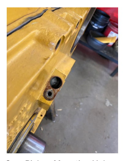
Cam Pickup Mounting Hole