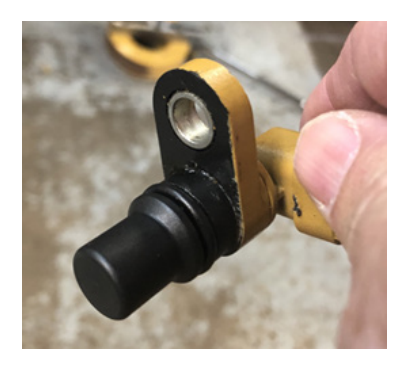
CAT OEM Sensor

Caterpillar® 3306B engines are originally equipped with a cam speed sensor which is triggered by a cam gear with a solid section that indexes the ignition. Altronic ignitions (CD1 or CD200) can utilize a 12mm magnetic pickup with an adapter using the 615762-KT "Kit" which includes the pickup adapter and the cam-mounted trigger disc. The 12mm x 1.0 threaded pickup (791041-3) is 3.0" long with 12" of wire and has the Packard connector that mates to the unshielded ignition harnesses. This pickup is not part of the kit and must be ordered separately.