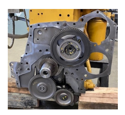
Cover removed showing original cam trigger gear